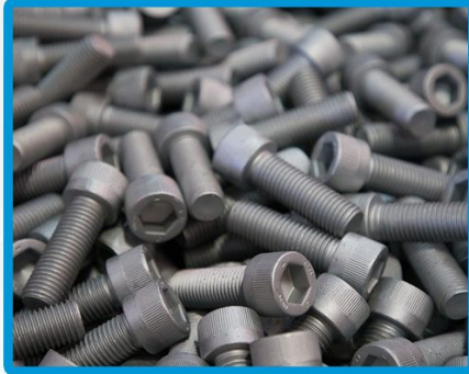
Aluminum Zinc Flake Coating