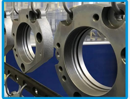
Zinc Nickel Plating