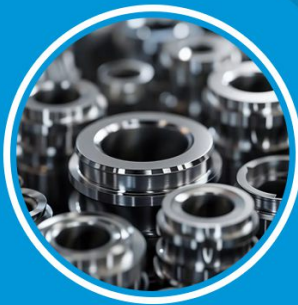
Bright Nickel Chrome