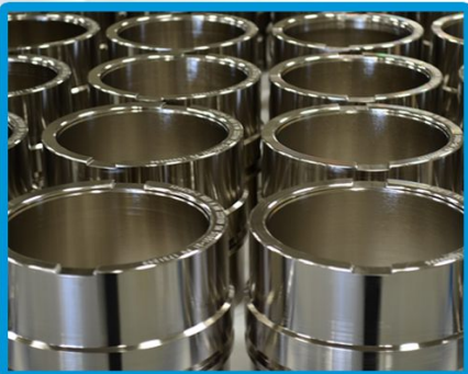
Nickel Chrome Plating